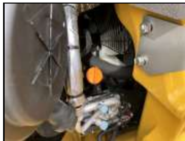
Engine Cooling Fan