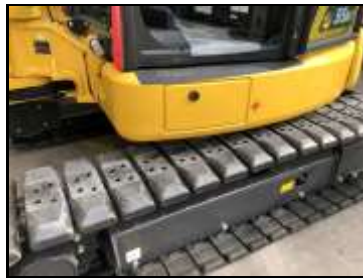
Height from track to cabin step