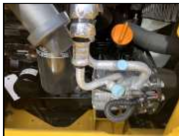
A/C Compressor Belt Pulley