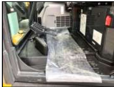
Operation Pedals and Levers