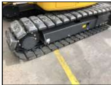
Height from ground to track